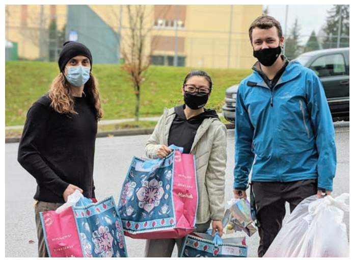
Boxes of Love donated to families through local school partners

As CityReach staff visited with local school staff, the requests for other kinds of support started pouring in. In addition to food security, they were noticing needs within families and students for things like mental health, social-emotional support and clothing. Through Adopt-a-School,