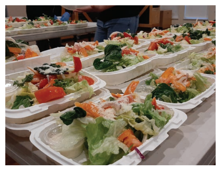
Volunteers prepare delicious meals for guests each week at Club Freedom