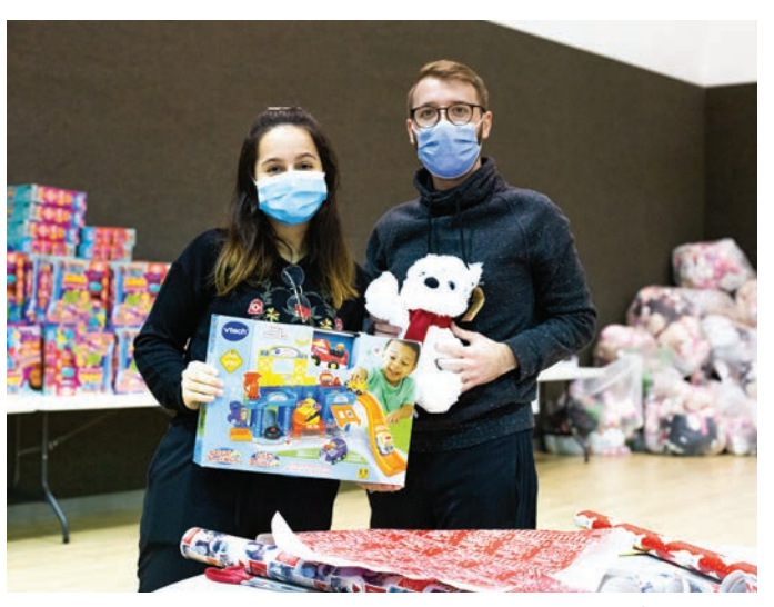
Volunteers packed and wrapped 150 Boxes of Love distributed in the Tri-Cities