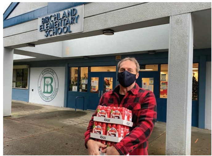
Donation of food hampers for families in need at Birchland Elementary School

In September 2020, when school was back in session, many schools reached out to ask for support. Several schools sent staff to CityReach to pick up a group of food hampers to be distributed to families right from the school who might otherwise not have access to the program. Other schools referred families directly to Food For Families to be able to access the program in person every week.