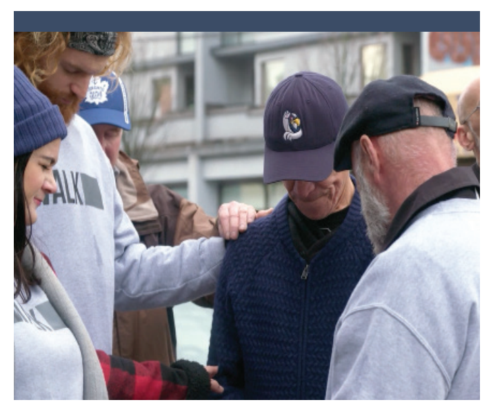
Prayer Walk volunteers in the DTES in early 2020

Thank you to the incredible volunteers who sacrificed so much to allow this program to succeed in 2020, and now into 2021.